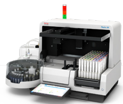
Phadia™ 200 instrument

A footprint smaller than 0.5 square meters—making it easy to place in both small and larger labs with space constraints. Processing 42 samples at a time and provide up to 96 test per run.