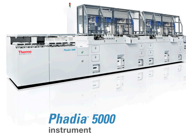
Phadia™ 5000 instrument

Doubles the capacity of Phadia 2500. With four process lines, it offers even greater flexibility.