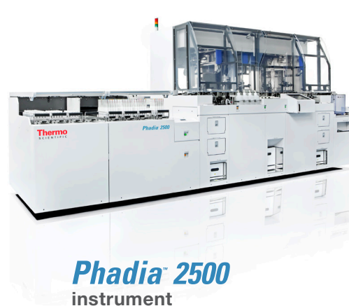
Phadia™ 2500 instrument

With two process lines it offers flexible configurations for high volume allergy and autoimmunity throughput needs.