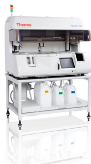
Phadia™ 250 instrument

Proves its reliability every day at laboratories around the world. More than 2000 systems are in use, often in a clustered set-up, running both allergy and autoimmunity tests.